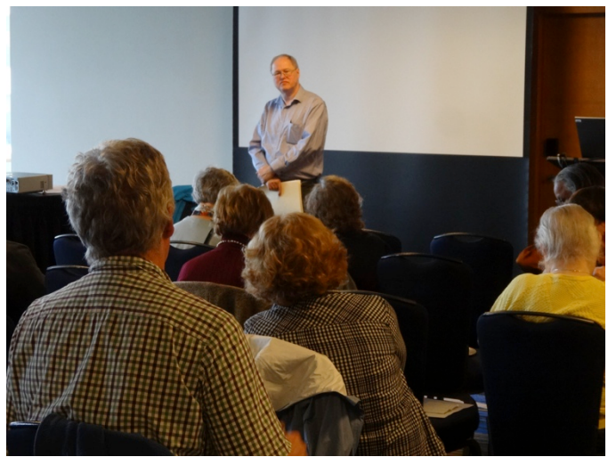
Members share discussions at the Professional Issues Round Table.