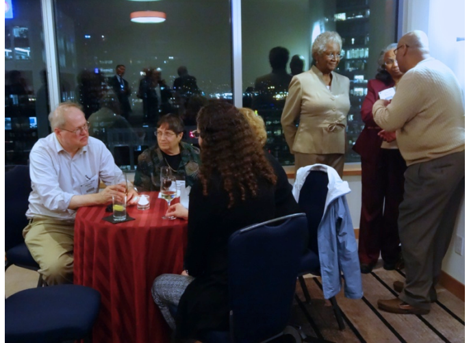
Members and friends socialize at the joint GSIS/GSA Geoinformatics Division Reception.