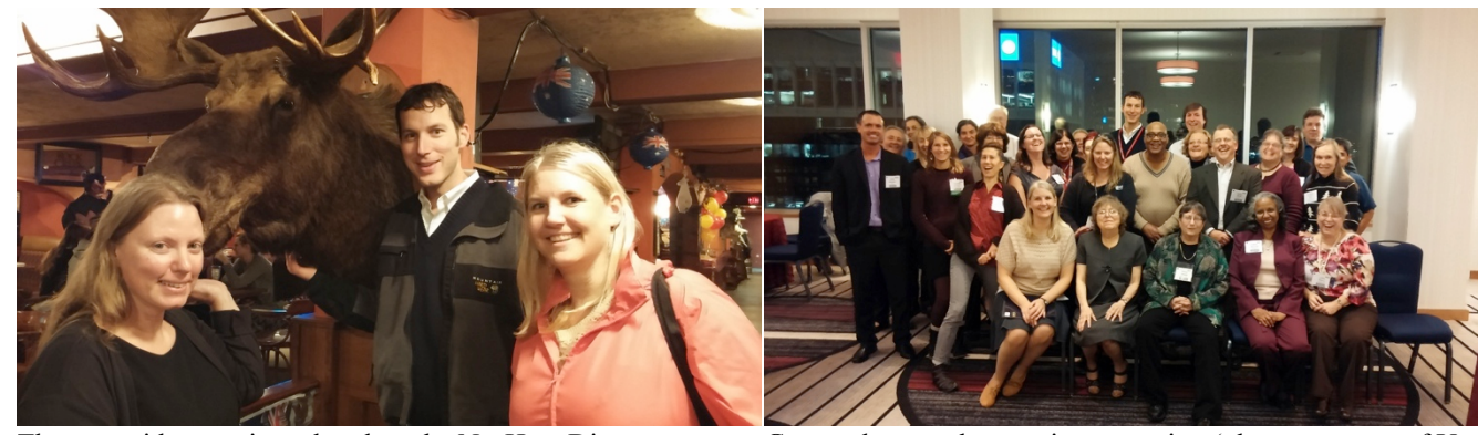
Three presidents enjoy a break at the No-Host Dinner following GL 101.