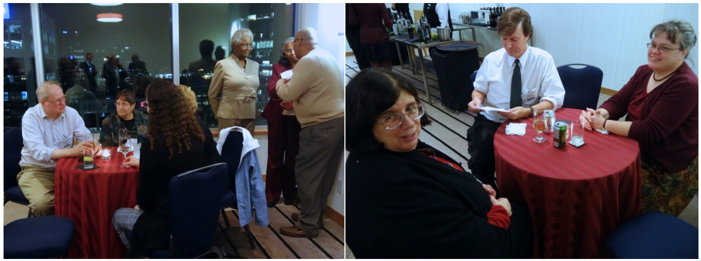
Members and friends socialize at the joint GSIS/GSA Geoinformatics Division Reception.